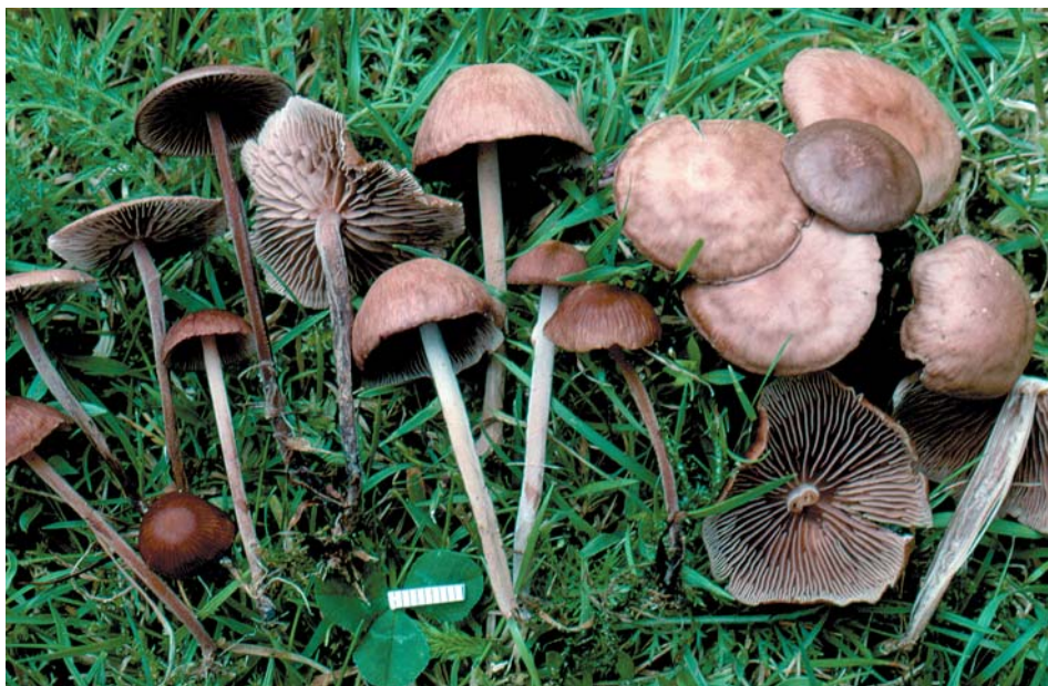
Fig. 3. Gymnopus obscuroides . England, Surrey, Kew, Royal Botanic Gardens, 30 June 1998.