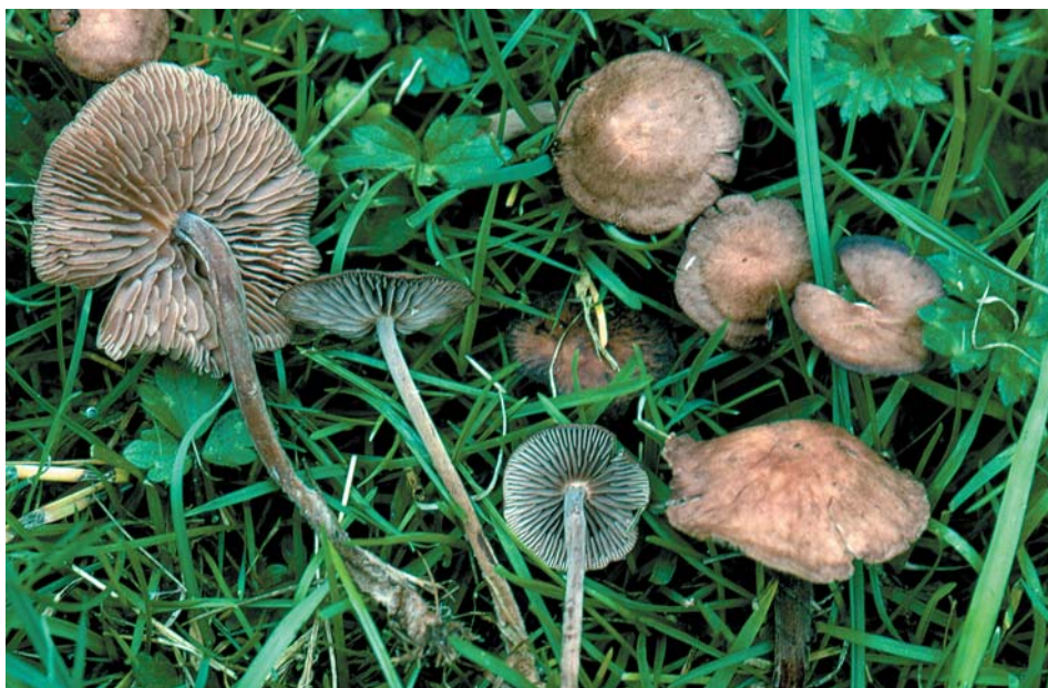
Fig. 2. Gymnopus obscuroides . England, Surrey, Windsor Great Park, Virginia Water, 24 Oct. 1991.