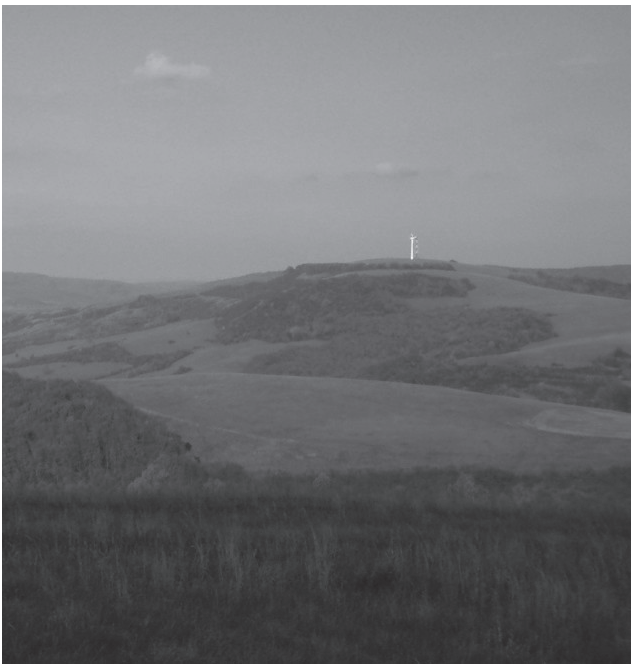
Fig. 8 Landscape area C1

The landscape unit C Pecková – Ostrý vrch is mainly agricultural landscape of extensive character which differs from the previous one in vertical articulation and varied mosaic of fields, meadows, pastures, forest, scattered greenery and crofts. It spreads on the left side of the river Téplica. The main axis of the landscape unit is given by four hills – Pecková (576 m), Vesný vrch (564 m), Nad Osičím (503 m) and Ostrý vrch (601 m).