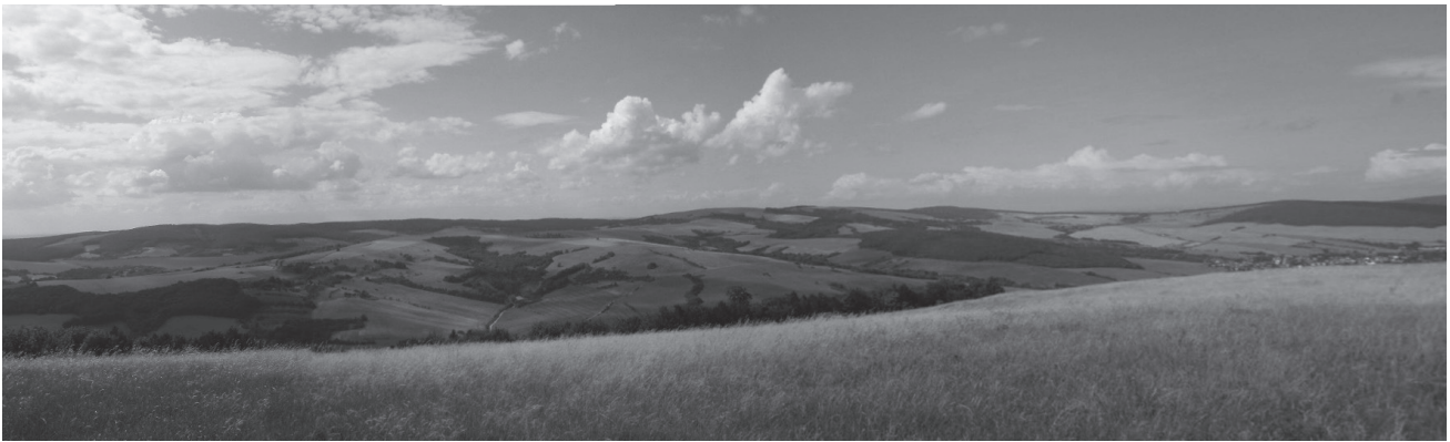
Fig. 7 View on the landscape area B3