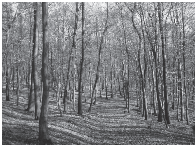
Fig. 3 Landscape area A1