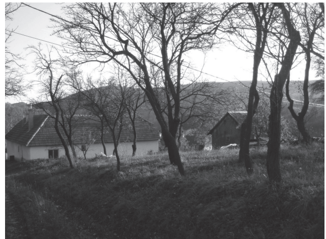
Fig. 9 The settlement Malejov (landscape area C2)

The landscape structure of the landscape area C1 Vesný vrch, Nad Osičím, Ostrý vrch (Figure 8) is varied. In the mosaic pastures and meadows predominate over arable land as it is in the landscape area B3. Dispersed settlement, old orchards, small fields, forest fragments and scattered greenery determine high landscape diversity. The hills enable long distance views. The landscape dominant of this landscape area has become a wind power plant on the hill Ostrý vrch (601 m a.s.l.). It is visible