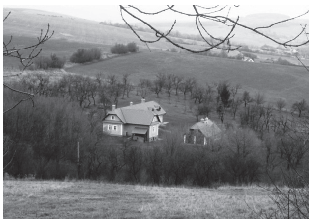
Fig. 6 Dispersed settlement Hate (landscape area B1)

located near river Chvojnica with the same named village Chvojnica along it. It represents strongly dissected hill country with the highest point of the entire model area called Žalostiná (622 m a.s.l.), which is an important viewpoint, as well (Figure 5). The landscape structure is varied, determined by dispersed character of settlement (Figure 6). Village Chvojnica has more dispersed than concentric character. With crofts, many elements such as old limes, orchards with old, nowadays very rare sorts of fruit, scattered greenery, are connected. They are surrounded by meadows, pastures, arable land and natural forest. High landscape diversity, typical urban structure of settlements, harmonic coexistence between man and nature, as well as the presence of rare biotopes and protected areas of interest of European Union determine high quality of the landscape area.