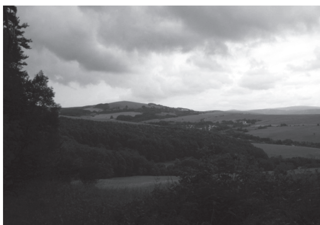
Fig. 5 View on the hill Žalostina (landscape area B1)