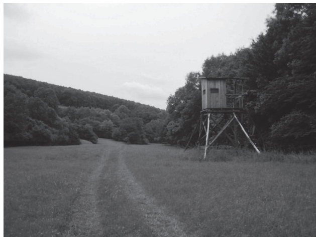
Fig. 4 Landscape area A2