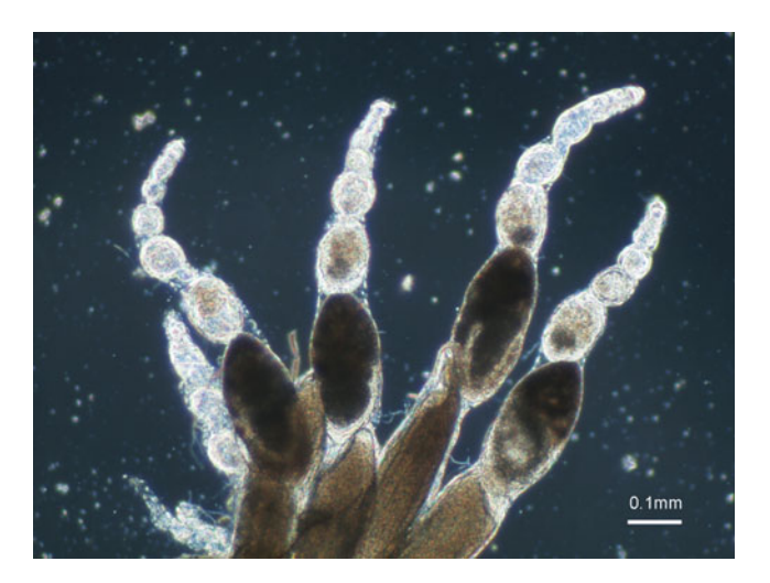
Fig. 1 Detail of the morphology of the reproductive system of female C. hemapterus . Several ovarioles with follicles at different degree of maturity can be seen. The least mature follicles are formed at the distal part of the ovariole (germarium). Follicles become mature (i.e. larger) as we move away from the germarium, so that mature, chorionated follicles can be observed at the lower part of the picture

As estimators of body size, length, and maximum width of abdomen and thorax of each female was measured prior to