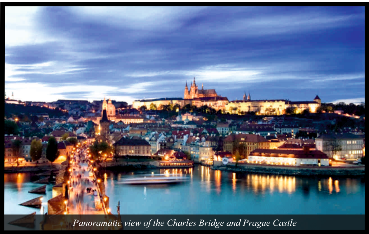
Panoramic view of the Charles Bridge and Prague Castle

Prague has been a political, cultural, and economic center of central Europe with waxing and waning fortunes during its 1,100-year existence. Founded during the Romanesque and flourishing by the Gothic and Renaissance eras, Prague was not only the capital of the Czech state, but also the seat of two Holy Roman Emperors and thus also the capital of the Holy Roman Empire.