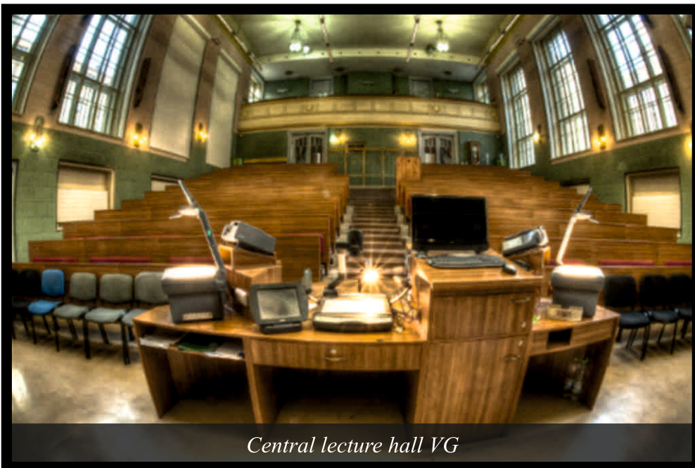
Central lecture hall VG

The main part of the conference will be held in the main building of the Faculty of Science at Albertov 6 . The Albertov campus is one of the main student centers in Prague as well as in the country as a whole. Many famous faculties are located here, i.e. First Faculty of Medicine, Faculty of Math and Physics, Faculty of Science. The Czech Technical University in Prague also has a building here.