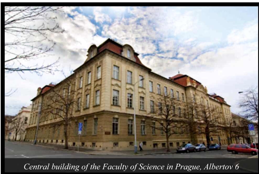
Central building of the Faculty of Science in Prague, Albertov 6

The whole campus area is an ideal place for gathering students from all around the world. It is right in the city center, very easily reachable by the public transportation. Despite the position in the heart of the city, the surroundings are calm and green. The Vltava River is not far from here, about 10 minutes' walk.