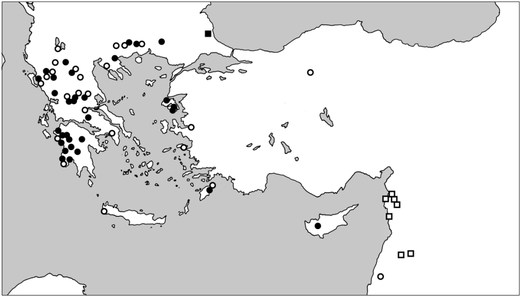
Fig. 2. Records of Pipistrellus pygmaeus (full symbols) and P. pipistrellus (open symbols) in the Eastern Mediterranean. Circles denote records of both forms after Hanák et al. (2001), Mayer & Helversen (2001a), and Dietz et al. (2002). The squares denote sites of records of P. pipistrellus in Syria and of P. pygmaeus in Turkey.

Our record of P. pygmaeus in Turkish Thrace is the first finding of this species in the country (Fig. 2); until now, only two records of this complex identified to species were mentioned from