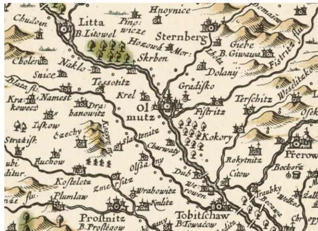
Figure 9: Surroundings of the Olomouc City on the Comenius's map of Moravia from the year 1627

Unity of Brethren. He wrote a number of pedagogical and theological works. After a devastating fire in Lešno Comenius left for Amsterdam, where he died in 1670.