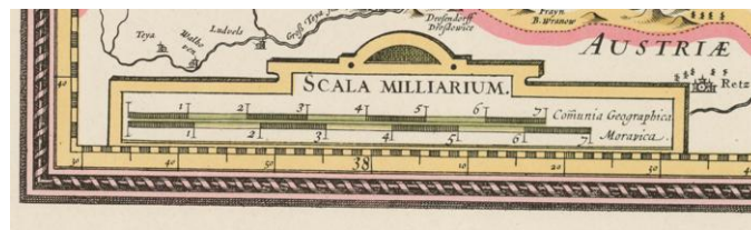
Figure 3: Scale on the Comenius's map from the year 1627

During the 1st half of 2008 the map fund of the Charles University was researched thoroughly, with particular emphasis on map works of Bohemia, Moravia and Silesia from the period 1518 - 1720. During the analysis and assessment of these old maps a number of questions and problems arose. The works' dating details served to determine the author, year of publication and name of publisher. In case only some data were stated on the map or they were completely absent, the map's date of origin was determined following the characteristic features for particular phases of cartographic production, for individual authors or publishers. The representation of map content, typeface, material used, reproduction technique and artistic elaboration are among such features. Authors of the maps were mostly cartographers, land surveyors, draftsmen, engravers, publishers, printers, clerks or artists. The information whether the work is an original, facsimile, copy or derivative was also important. In our selection Comenius's map of Moravia is a facsimile. Other maps are originals.