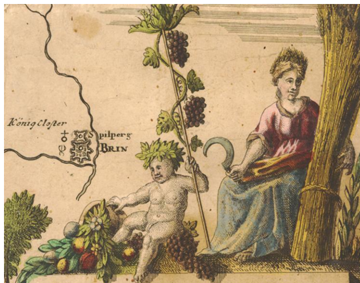
Figure 12: Persons on the Vogt's map of Bohemia from the year 1712

The Map Collection of the Charles University currently contains several other cartographic works from the period 1518 – 1720. Their content and cartometric analyses will follow.