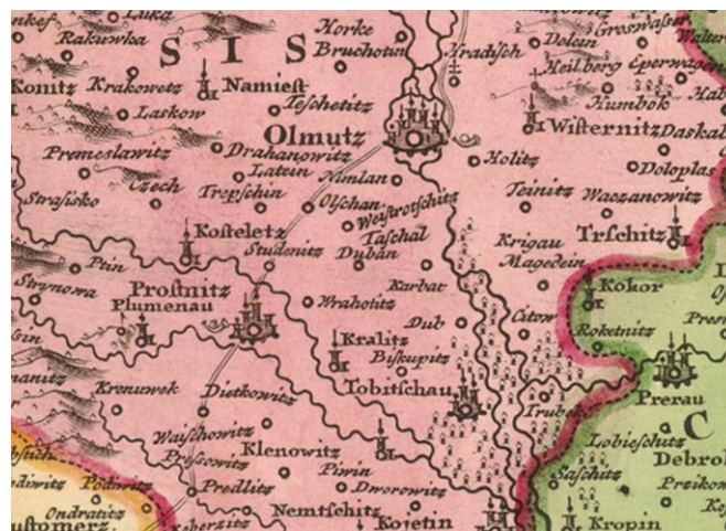
Figure 10: Surroundings of the Olomouc City on the Müller's map of Moravia by J. B. Homann

The mapping was done from 1708 to 1712. The map represented " all roads and tollgates for the needs of the country and for the safety of travellers ". According to Müller's plan each of the six Moravian regions was mapped individually. These regional maps were used to compile an overall map of Moravia. The final revision was created in 1716 and the documents necessary for the engraving were handed over to the engraver Jan Kryštof Leidig from Brno.