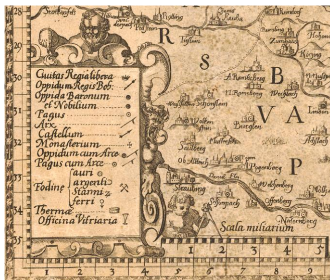
Figure 4: Legend and scale on the Aretin's map from the year 1632

governing divisions of depicted areas are represented by various types of boundary lines and surfaces of different colours.