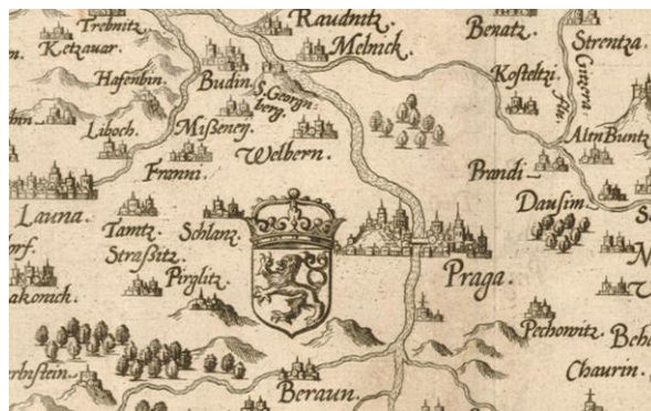
Figure 5: Surroundings of the Prague City on the Criginger's map of Bohemia, copies by Gerhard de Jode

Johann Criginger (1521 – 1571) created a map of Bohemia oriented to north - Bohemiae regni nova chorographica descriptio . The map is historically the second map image of Bohemia. The map of Bohemia was adopted from many Dutch atlases - Ortelius (1570), Mercator (1585). The precious copy by Gerhard de Jode is less known. Its reprint was found in the Map Collection of Charles University in Prague.