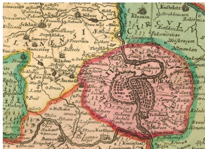
Figure 7: Surroundings of the Prague City on the Vogt's map of Bohemia from the year 1712

Vogt's map is an important cartographic work dated in the first quarter of the 18th century. Its author is Johann Georg Vogt, the abbot of the Plasy Monastery. The format of the map is 853 x 656 mm. The scale along the central meridian is 1 : 396 800. The map is not created following a particular cartographic representation. The map is inserted in a frame which is divided by a two-second scale.