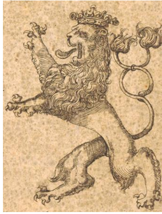
Figure 1: Bohemia Lion on the Aretin's map of Bohemia from the year

The results of the research are described in the text below using knowledge from historical and cartographic studies of the last decades.