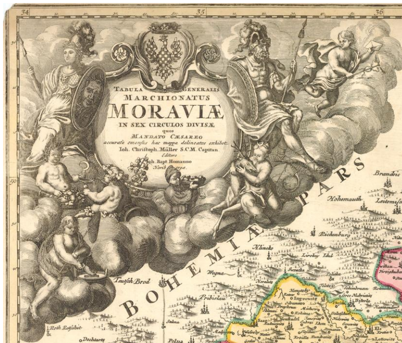
Figure 2: Complement placed in the corners map sheets of Müller's map of Moravia