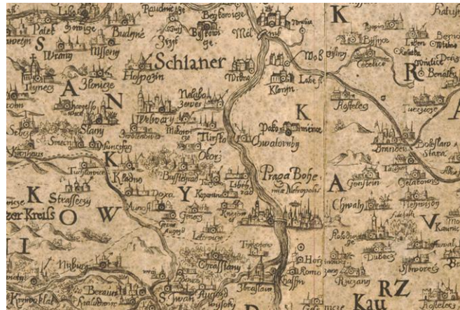
Figure 6: Surroundings of the Prague City on the Aretin's map of Bohemia from the year 1632

The map titled Regni Bohemia nova et exacta descriptio (New and exact description of the Bohemian kingdom) was created by Petr Aretin of Ehrenfeld (1570-1640) as the historically third map image of Bohemia. The map was first published in 1619. In our collection we found the second and third publication of the map. The second revised and supplemented publication is dated 1632 and was used as a military map during the Thirty Years War. On the right and left edge of the map there are six figures in period garments. Six female figures on the right edge and six male figures on the left edge. In the upper right corner the Czech lion is represented and in the upper left corner there is the imperial eagle.