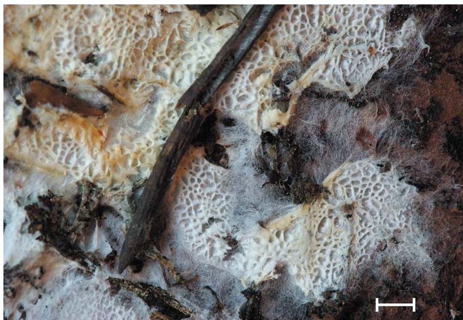
Fig. 2. Sistotrema dennisii – dried fruitbody stored in the PRM herbarium. Bar =1 mm.