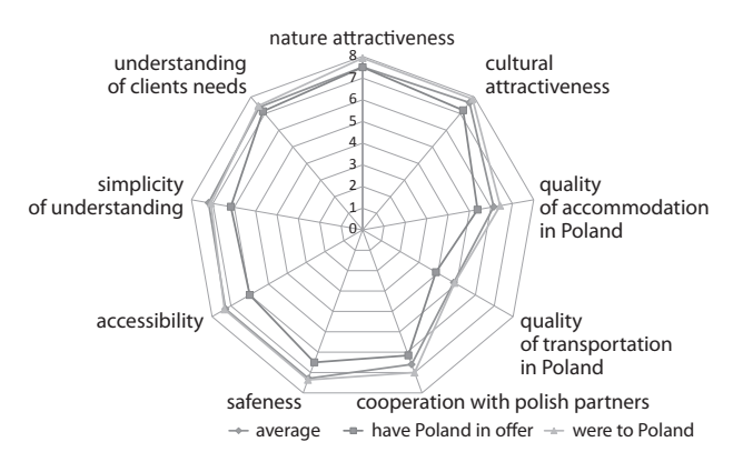
Fig. 2 Assessment of the quality of Poland as a tourist destination in the eyes of employees of travel agencies

This part of the study deals with assessment of the quality of Poland as a tourist destination in the eyes of employees of travel agencies. They were asked about their personal opinion on the primary and secondary offer of tourism in Poland which they possibly present to their clients. The Figure 2 represents the comparison of the assessment of the primary and secondary offer done by the well informed employees of the agencies who either offer trips to Poland or have visited Poland personally.