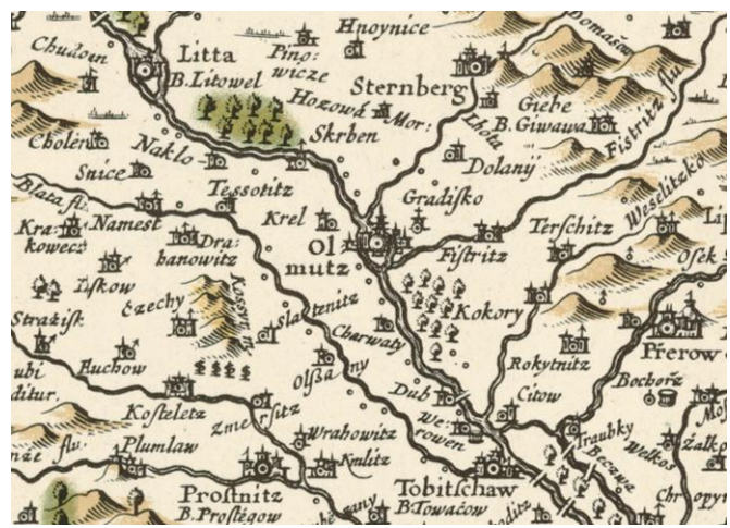
Figure 9: Surroundings of the Olomouc City on the Comenius's map of Moravia from the year 1627

Unity of Brethren. He wrote a number of pedagogical and theological works. After a devastating fire in Lešno Comenius left for Amsterdam, where he died in 1670.