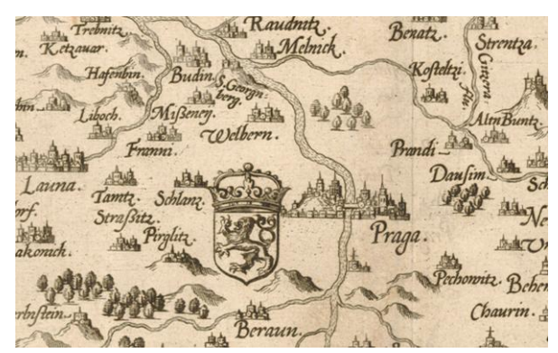
Figure 5: Surroundings of the Prague City on the Criginger's map of Bohemia, copies by Gerhard de Jode

Johann Criginger (1521 - 1571) created a map of Bohemia oriented to north - Bohemiae regni nova chorographica descriptio. The map is historically the second map image of Bohemia. The map of Bohemia was adopted from many Dutch atlases - Ortelius (1570), Mercator (1585). The precious copy by Gerhard de Jode is less known. Its reprint was found in the Map Collection of Charles University in Prague.