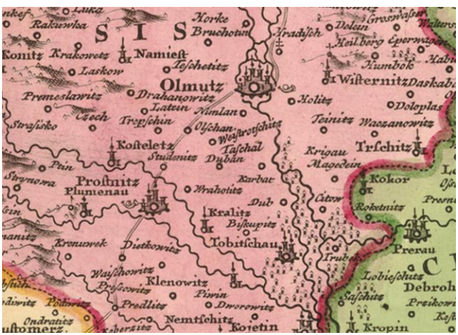
Figure 10: Surroundings of the Olomouc City on the M'uller's map of Moravia by J. B. Homann

The mapping was done from 1708 to 1712. The map represented "all roads and tollgates for the needs of the country and for the safety of travellers". According to Müller's plan each of the six Moravian regions was mapped individually. These regional maps were used to compile an overall map of Moravia. The final revision was created in 1716 and the documents necessary for the engraving were handed over to the engraver Jan Kryštof Leidig from Brno.