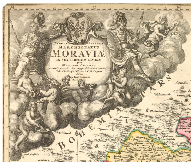
Figure 2: Complement placed in the corners map sheets of Müller's map of Moravia