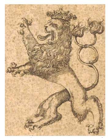
Figure 1: Bohemia Lion on the Aretin's map of Bohemia from the year

The results of the research are described in the text below using knowledge from historical and cartographic studies of the last decades.