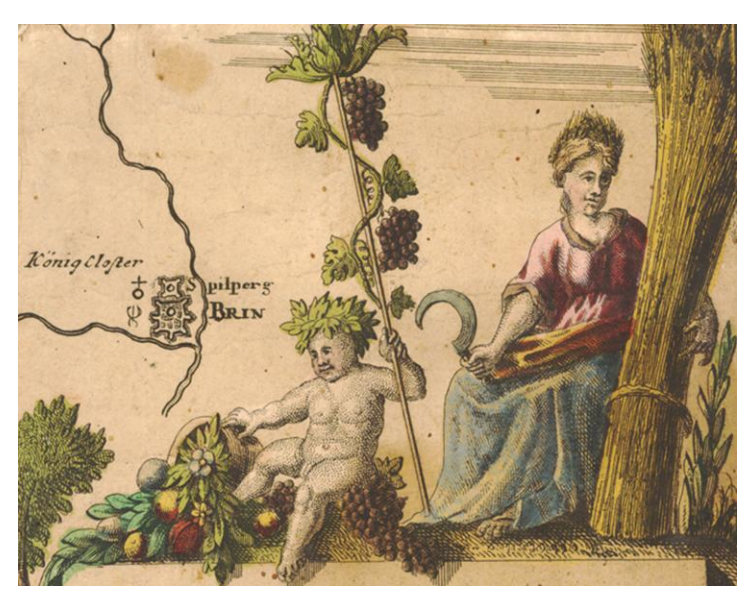
Figure 12: Persons on the Vogt's map of Bohemia from the year 1712

The Map Collection of the Charles University currently contains several other cartographic works from the period 1518 - 1720. Their content and cartometric analyses will follow.