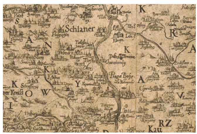
Figure 6: Surroundings of the Prague City on the Aretin's map of Bohemia from the year 1632

The map titled Regni Bohemia nova et exacta descriptio (New and exact description of the Bohemian kingdom) was created by Petr Aretin of Ehrenfeld (1570-1640) as the historically third map image of Bohemia. The map was first published in 1619. In our collection we found the second and third publication of the map. The second revised and supplemented publication is dated 1632 and was used as a military map during the Thirty Years War. On the right and left edge of the map there are six figures in period garments. Six female figures on the right edge and six male figures on the left edge. In the upper right corner the Czech lion is represented and in the upper left corner there is the imperial eagle.