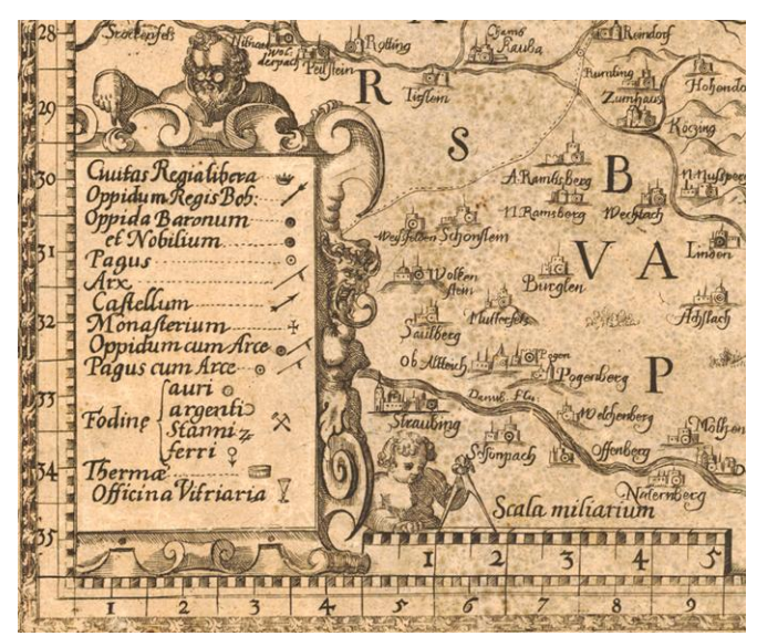
Figure 4: Legend and scale on the Aretin's map from the year 1632

governing divisions of depicted areas are represented by various types of boundary lines and surfaces of different colours.