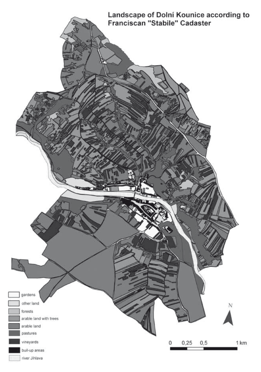
Fig. 4 Landscape of Dolní Kounice according to Franciscan "Stabile" Cadastre

and institutions there were vicarage, school, synagogue, town hall, poorhouse, hospital and an isolated inn on the Charles' hill (Karlův kopec). There were only few forests, primarily at the northern boundary of the cadastre, totalling 6.8 hectares of coniferous forest, and also mixed forest on one plot. Spatial distribution of this basic land use unit presents Fig. 4.