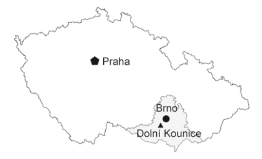
Fig. 1 Location of Dolní Kounice – area of interest

The presented text is a historical-geographical study of a small Moravian town of Dolní Kounice, which was carried out by analysing the data from the Franciscan Cadastre of this town located 20 km southwest of Brno, in dissected landscape at the border of Bobrava Highlands and Dyjsko-svratecký úval Graben (see Fig. 1).