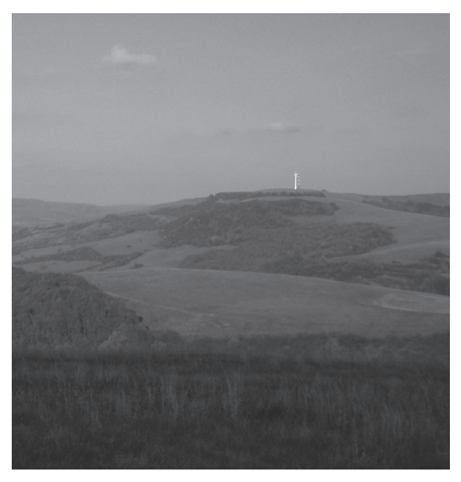
Fig. 8 Landscape area C1

The landscape unit C Pecková – Ostrý vrch is mainly agricultural landscape of extensive character which differs from the previous one in vertical articulation and varied mosaic of fields, meadows, pastures, forest, scattered greenery and crofts. It spreads on the left side of the river Teplica. The main axis of the landscape unit is given by four hills – Pecková (576 m), Vesný vrch (564 m), Nad Osičím (503 m) and Ostrý vrch (601 m).