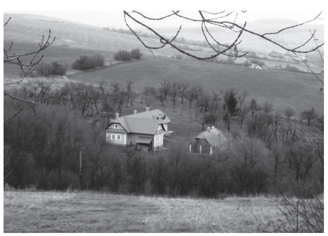
Fig. 6 Dispersed settlement Hate (landscape area B1)

located near river Chvojnica with the same named village Chvojnica along it. It represents strongly dissected hill country with the highest point of the entire model area called Žalostiná (622 m a.s.l.), which is an important viewpoint, as well (Figure 5). The landscape structure is varied, determined by dispersed character of settlement (Figure 6). Village Chvojnica has more dispersed than concentric character. With crofts, many elements such as old limes, orchards with old, nowadays very rare sorts of fruit, scattered greenery, are connected. They are surrounded by meadows, pastures, arable land and natural forest. High landscape diversity, typical urban structure of settlements, harmonic coexistence between man and nature, as well as the presence of rare biotopes and protected areas of interest of European Union determine high quality of the landscape area.