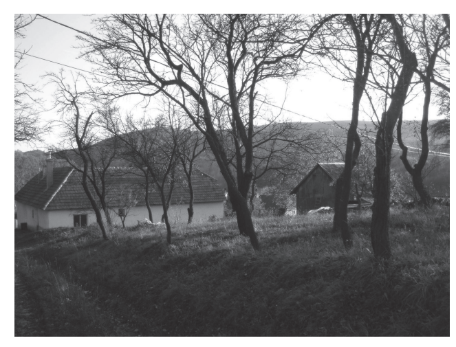
Fig. 9 The settlement Malejov (landscape area C2)

The landscape structure of the landscape area C1 Vesný vrch , Nad Osičím , Ostrý vrch (Figure 8) is varied. In the mosaic pastures and meadows predominate over arable land as it is in the landscape area B3. Dispersed settlement, old orchards, small fields, forest fragments and scattered greenery determine high landscape diversity. The hills enable long distance views. The landscape dominant of this landscape area has become a wind power plant on the hill Ostrý vrch (601 m a.s.l.). It is visible