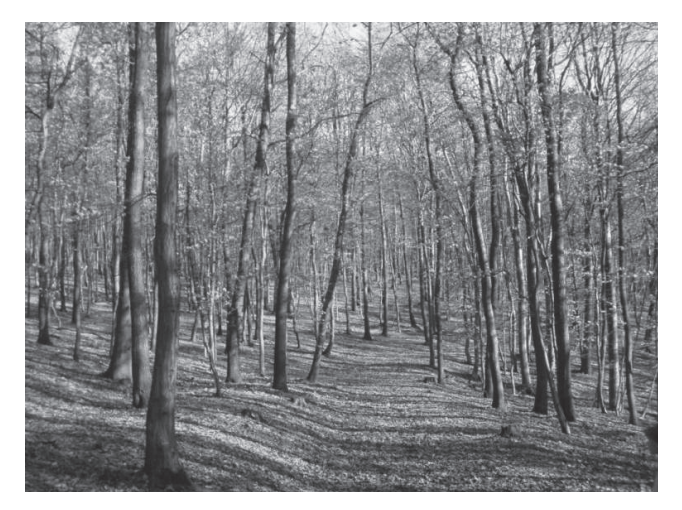
Fig. 3 Landscape area A1