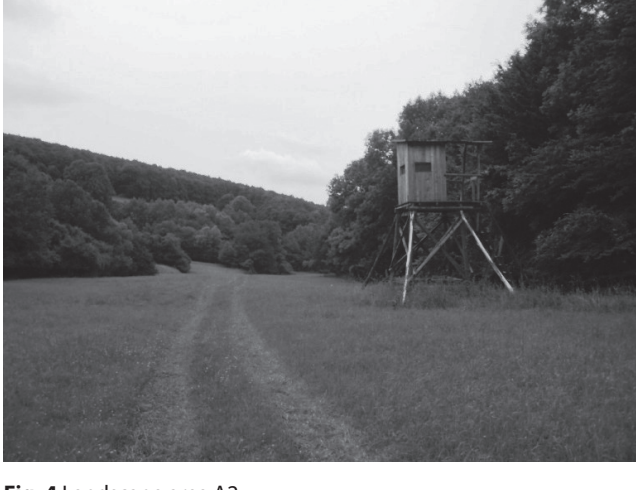
Fig. 4 Landscape area A2