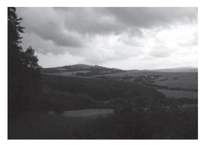
Fig. 5 View on the hill Žalostina (landscape area B1)