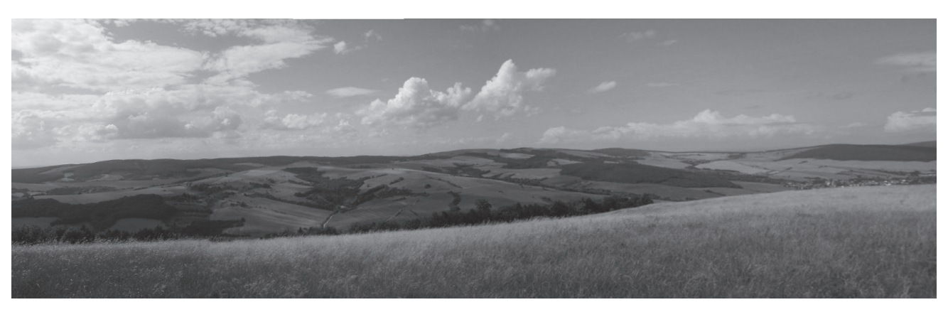
Fig. 7 View on the landscape area B3