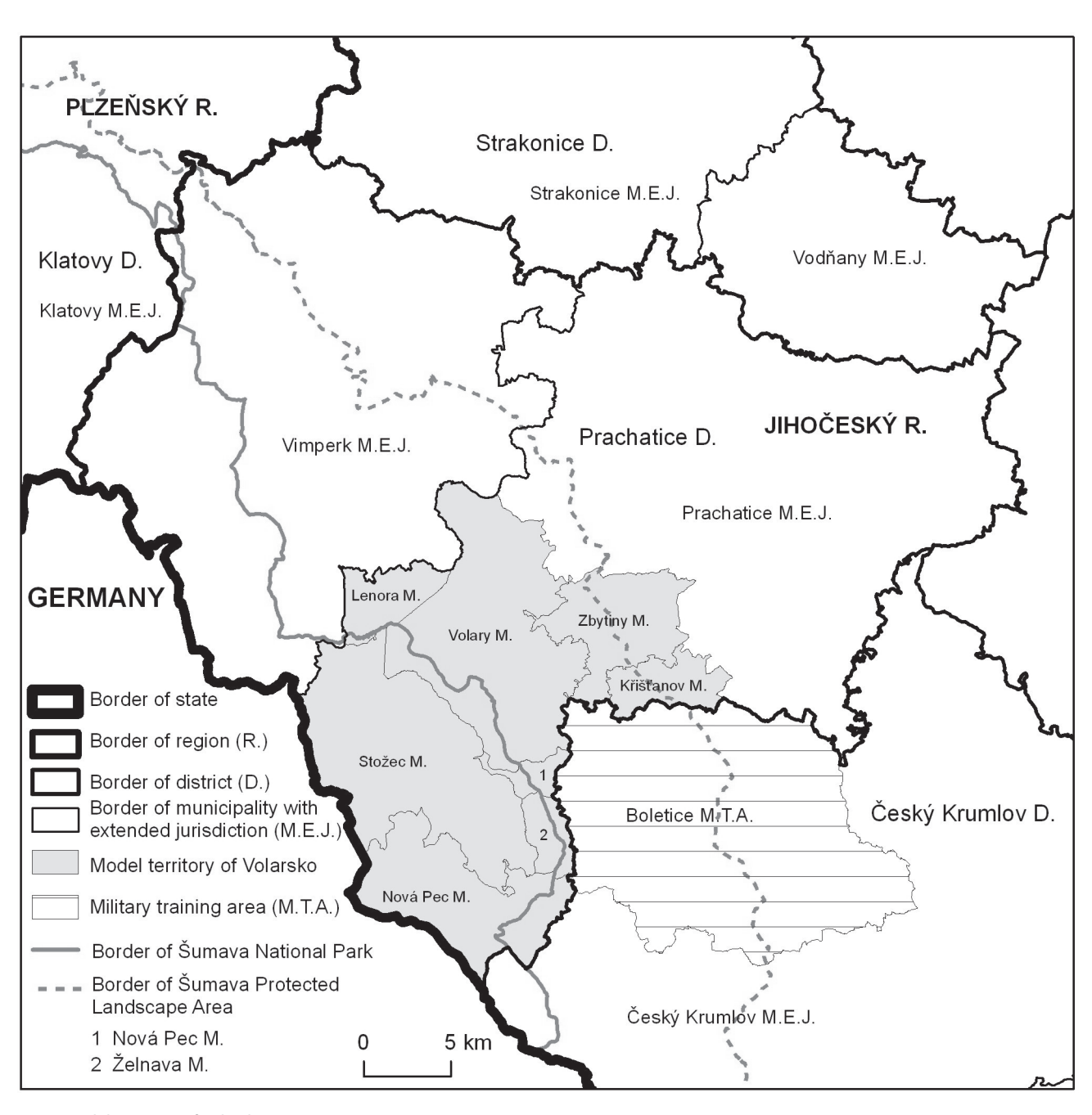
Fig. 1 Model territory of Volarsko

Common denominators of all municipalities in the model territory include their historical development (post-World War II expulsion of Germans and subsequent partial resettlement), which had in principle influence not only on quantitative as well as the qualitative "state" of the territory (Chromý, Jančák 2005), and relatively strong pressures focused on the conservation of nature (Šumava National Park is located along the border with Germany and Austria to the southeast and the Šumava Protected Landscape Area, another