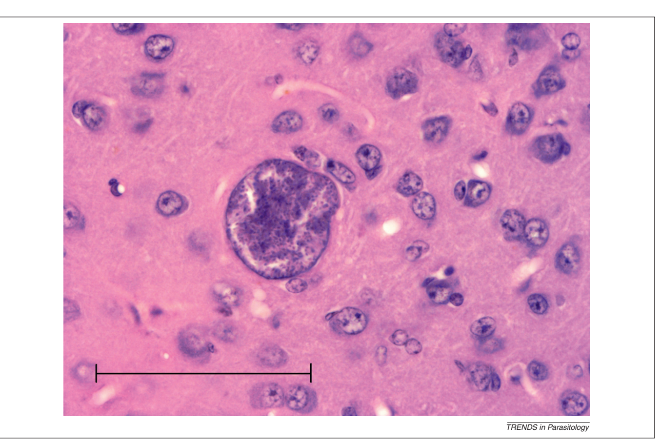
Figure 1. Toxoplasma gondii tissue cyst in the brain of chronically infected CD1 mice. Scale bar, 100 \mu m.

immune system of the host uses in its response to parasites. It is also possible that some of the observed effects represent side effects of manipulation activity of Toxo plasma that aims to influence not the behavior but some