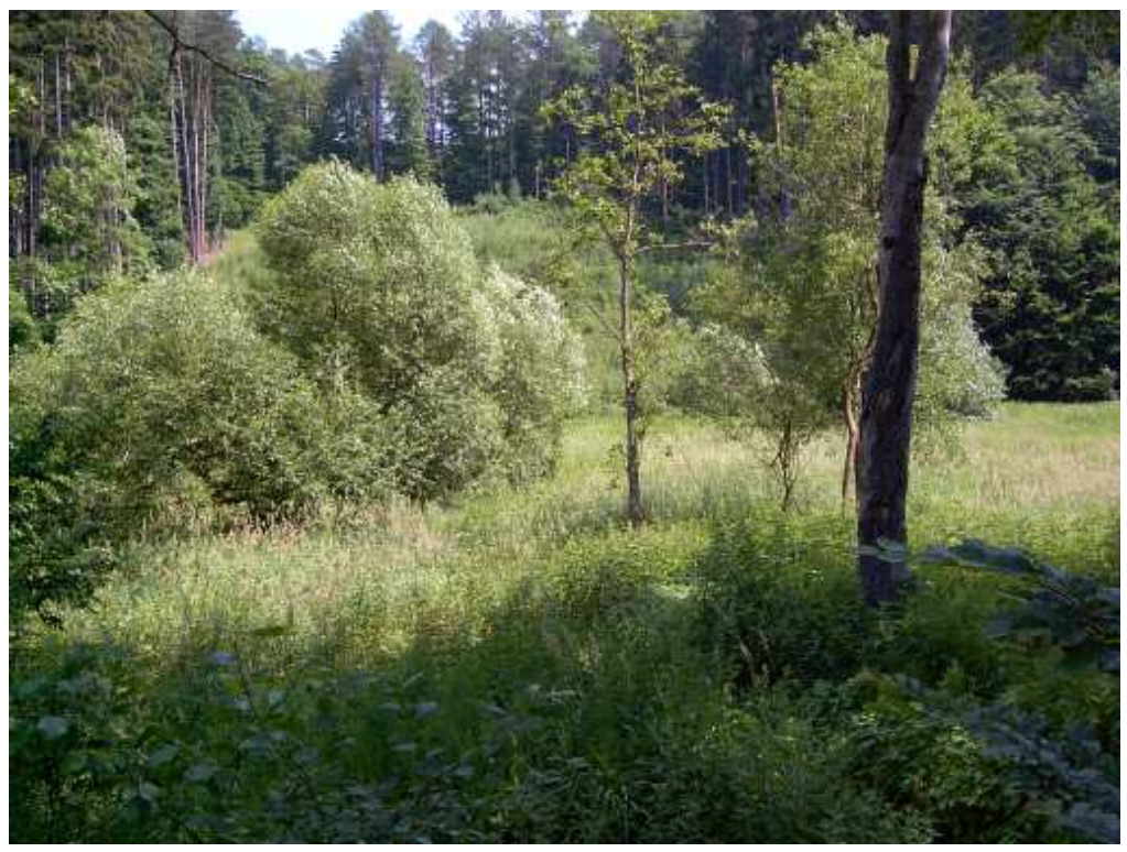
Abandoned agricultural land and the "new wilderness"