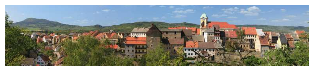
The town of Úštek – the Urban Monuments Reservation area