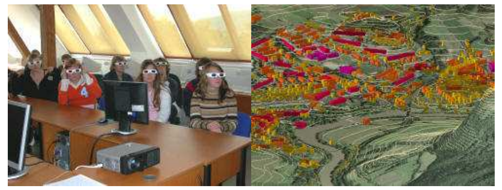
Centre of 3D Modelling and Virtual Reality, J.E. Purkyně University in Ústí nad Labem (source: <a href="http://geography.ujep.cz/geo_s/3dlab.html">http://geography.ujep.cz/geo_s/3dlab.html</a>)