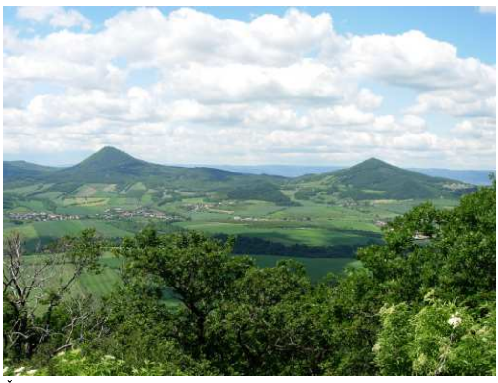
České středohoří Mountains