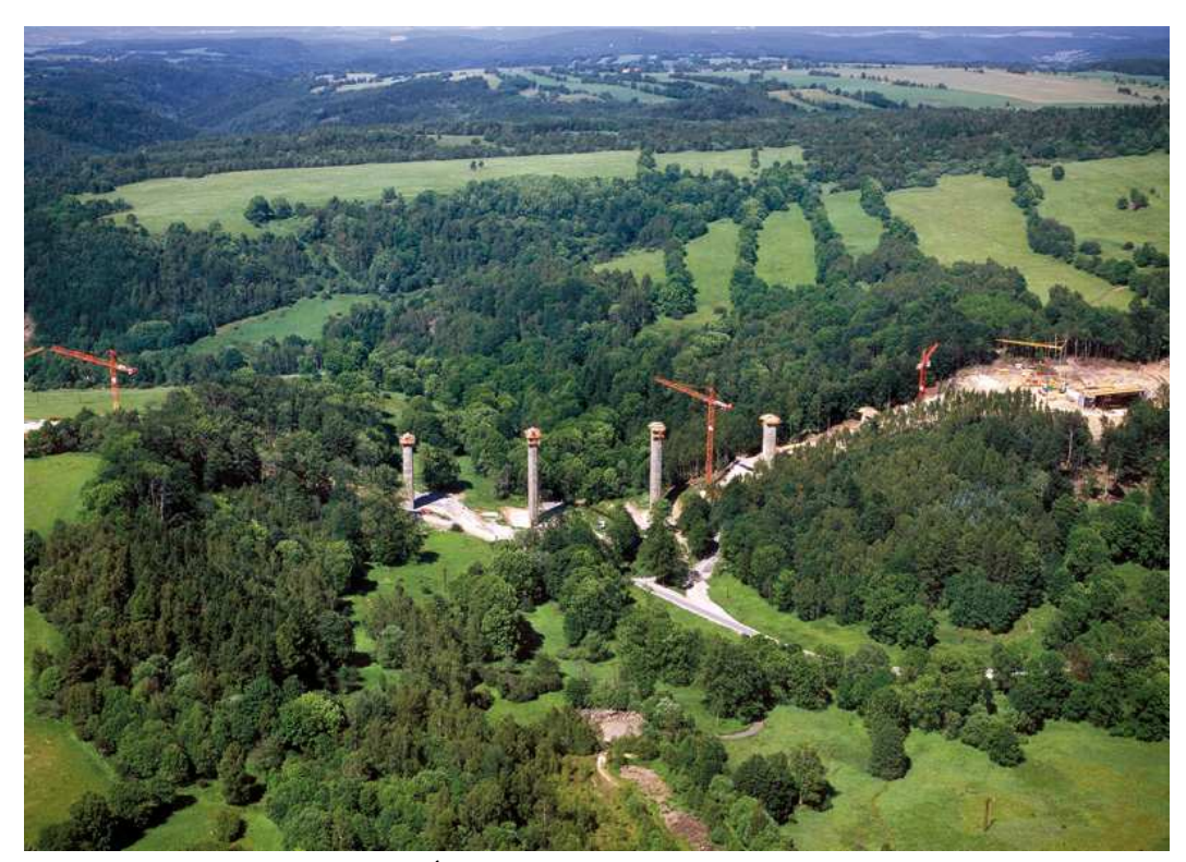
The \bf D8 \bf Highway (Prague – Ústí nad Labem – Dresden)