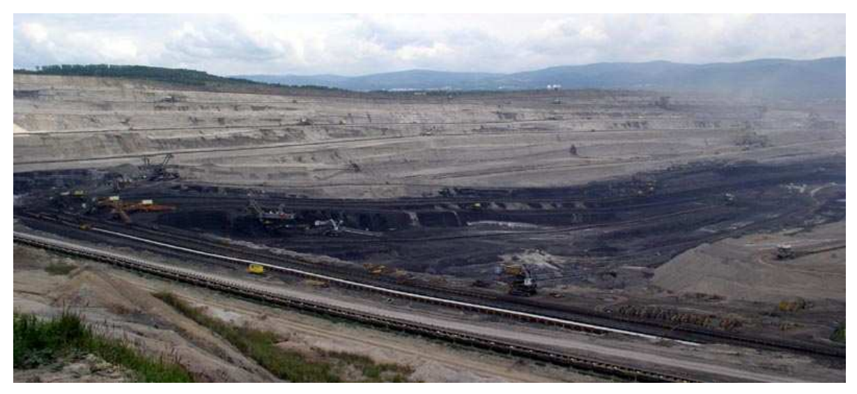
Appendix IV: Where the Field Excursion is going to take place