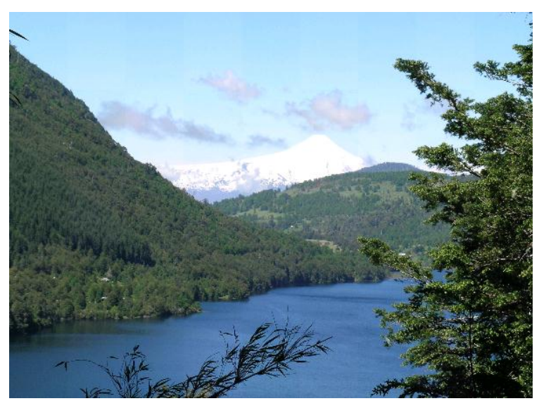
Field trip during IGC in Chile – National park protects remains of temperate zones forests, in higher altitudes with a lot of Arauacaria species.