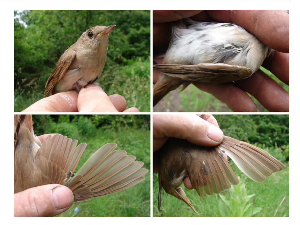
Fig. 1 Female hybrid between L. megarhynchos and L. luscinia captured on 3 June 2009 near Mladá Boleslav, Czech Republic ( top left ). Unexpectedly, considering the date of capture, the hybrid female was in the process of moulting as can be seen on the belly ( top right ) as well as both wings ( bottom ).

Storchová et al. (2010). The tree was reconstructed in MEGA 4.0 software (Tamura et al. 2007) using maximum composite likelihood method for estimating evolutionary distances. The sequence of the hybrid female clearly clusters with sequences of L. megarhynchos in both genes, indicating that the Z chromosome of the hybrid female comes from this species.